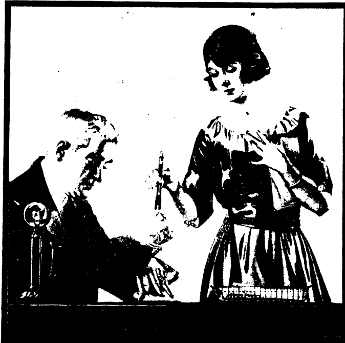
Life Time Pen illustrated with clip, $8.75

Painted by Coles Phillips expressly for W. A. Sheaffer Pen Co.